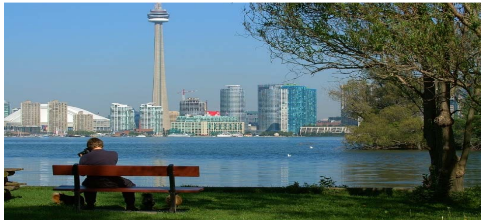
A breathtaking view of the City of Toronto skyline.

The Centre for Research on Inner City Health at St. Michael's Hospital is excited to host the 4th International Conference on Urban Health, scheduled to take place in Toronto, Canada from October 26 – 28, 2005. The theme for this year's conference is "Achieving Social Justice in Urban Communities."